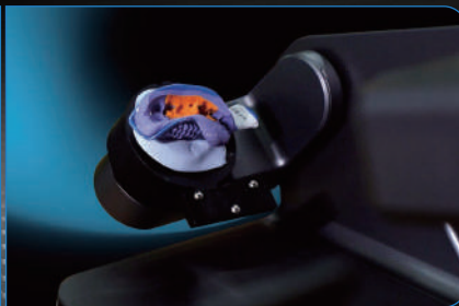
Post and Core