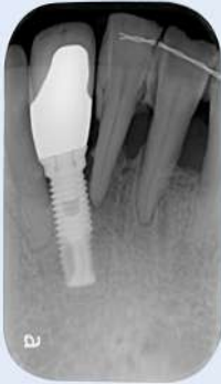
Implant - Size 1 PSP