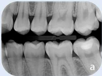
Bitewing - Size 2 PSP