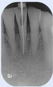
Endo - Size 0 PSP