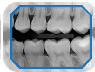
Common Sensor Size 2