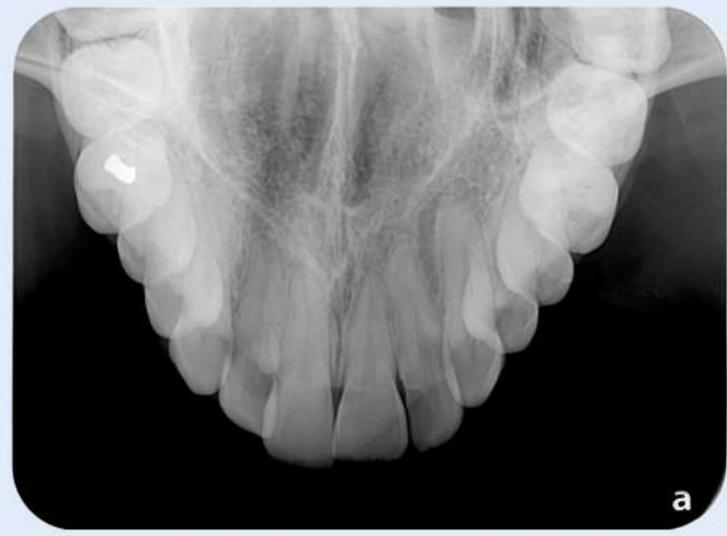
Occlusal - Size 4 PSP