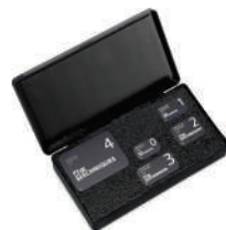
Plate Transfer Box

Size 0, PN 73566-0, Qty. 1 Size 1, PN 73566-1, Qty. 1 Size 2, PN 73566-2, Qty. 1 Size 3, PN 73566-3, Qty. 1 Size 4, PN 73566-4, Qty. 1