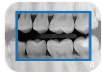
Common Sensor Size 1

The level of detail and clarity achieved by ScanX PSPs is superior to that of X-Ray film and other PSP systems. Your images will enable you to make reliable and sound treatment diagnoses.