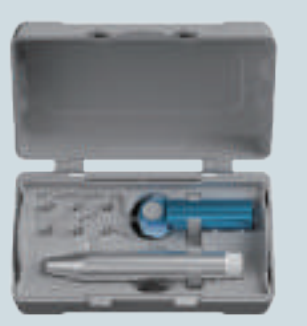
Tips: G1 G2 G4 P1 P3 E4 universal wrench, EMS type handpiece