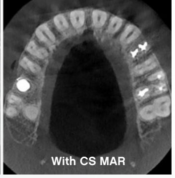
CS MAR allows significant reduction of artifacts caused by implants, fillings or restorations.